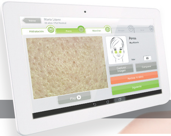
High Resolution Wireless Diagnostic System